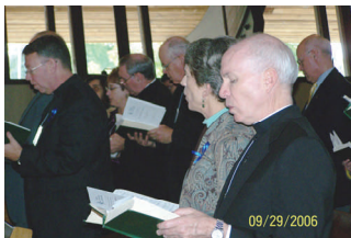
Assembly participants worshipping during the Prayer Service.

The concise, inspirational mission of the Illinois Council of Churches has an operational statement that can be said "to have legs". It can be put into action. The first annual assembly proved this to be true. The Assembly itself developed out of the three mandates within our mission statement.